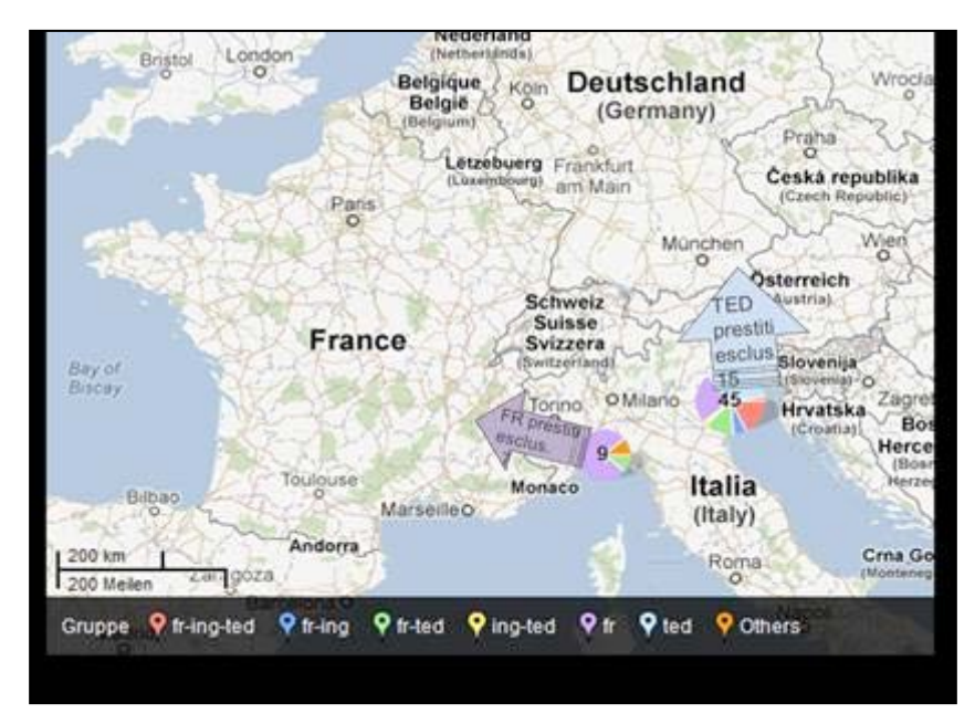
Figure 3: OIMap – Areal dynamics of Genoese and Venetian borrowings (FR = French, TED = German).

3 an arrow indicates the main direction of borrowings where an absolute (Genoese: 7 out of 9) or relative (Venetian: 15 out of 45) majority of loan elements 'migrates' exclusively towards one language (French and German respectively).